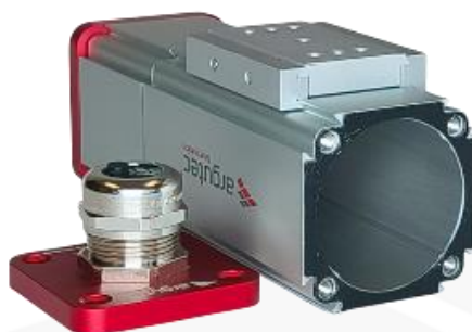
Figure 3 – Removing the back of the cover

Remove the back of the cover if you did not do it in step 2.