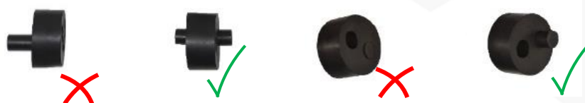
Figure 4 – Correct and incorrect \varnothing 6mm seal into the insert before tightening the cable gland

Attention! The \varnothing 6mm seal is longer than the insert itself. The \varnothing 6mm seal must be inserted at least 5 mm over the insert's edge on the both sides! Subsequently, it is necessary to tighten the nut of the cable gland as much as possible. If the \varnothing 6mm seal does not protrude from both sides of the insert, over time it will be pushed out of the housing or inside the housing and the IP protection will be violated!