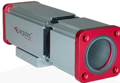
Figure 1 – Dismantling the front part

Remove the four cap screws to remove the front part ( Figure 1 – Dismantling the front part ) and slide the front part forward.